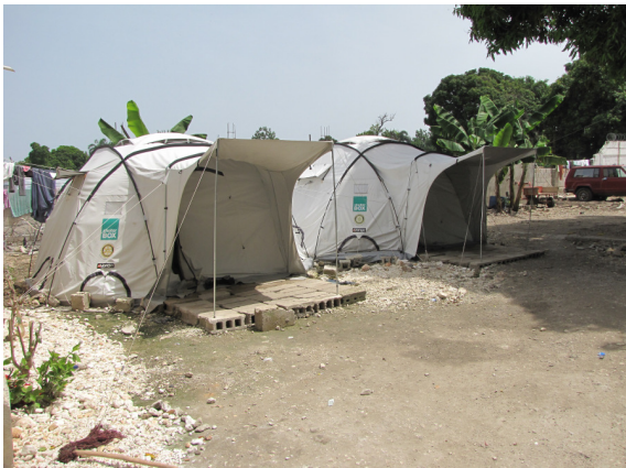
Thirteen larger, more livable tents have been erected on concrete block platforms to keep them out of heavy rains.