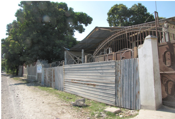
Temporary sheet-metal walls were erected shortly after the earthquake to protect the children (view from the main entrance).