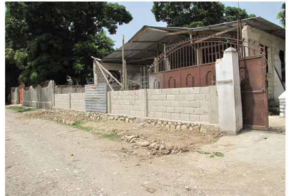
Most of the sheet-metal has been replaced with concrete blocks and reinforced columns.