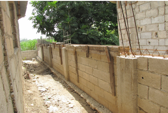
Well-constructed, reinforced concrete block forms the base for the new security walls.