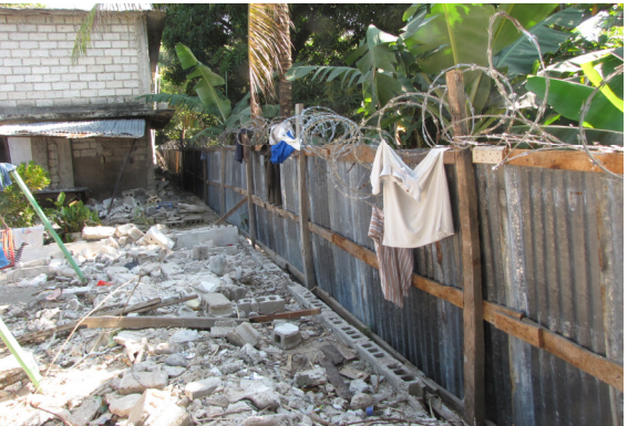
Another view of the temporary sheet-metal compound walls and the rubble that was once a security wall.