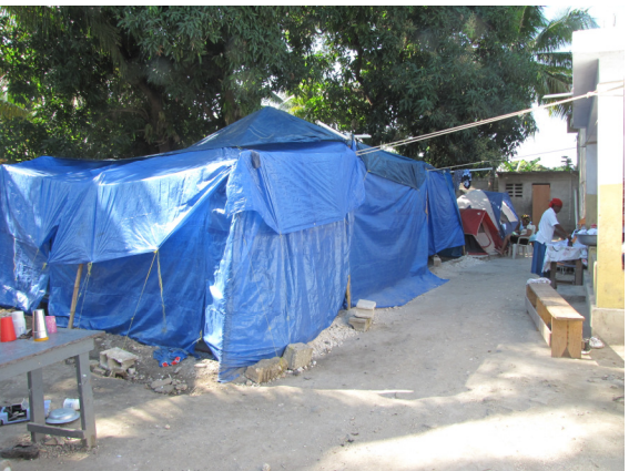
Temporary living space was erected using rope and blue plastic tarps to protect the children from the elements.