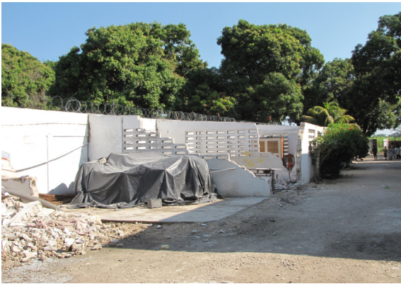
Portions of the storage areas were reduced to rubble by the quake.