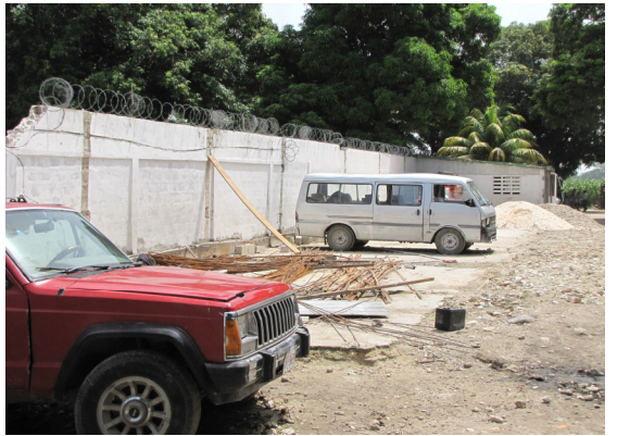
The damaged walls are torn down, the rubble is removed and the area is ready for rebuilding.