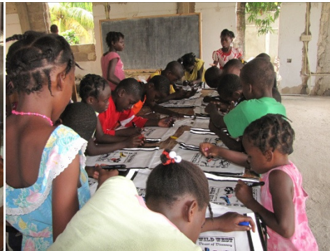
Boys and girls from 6 to 25 all enjoyed decorating and personalizing backpacks left over from a VBS stateside.