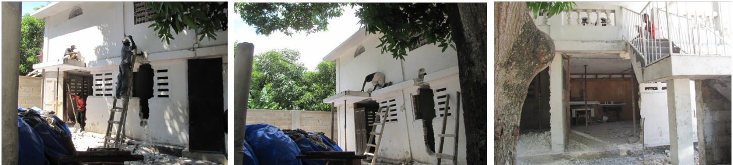
Supporting the second floor, removing the damaged walls and preparing spaces for new larger support columns were some of the first day's reconstruction activities.