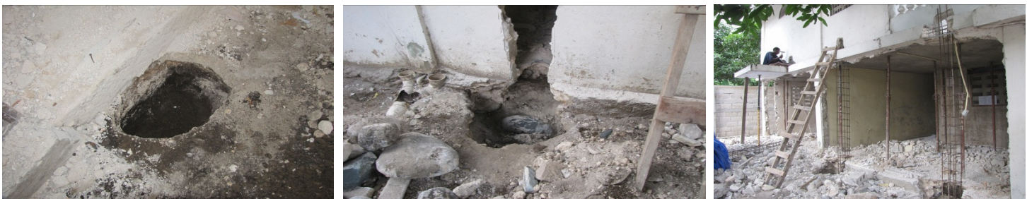
Larger deeper support bases and complete lower wall removal were completed and now we're now ready to begin rebuilding