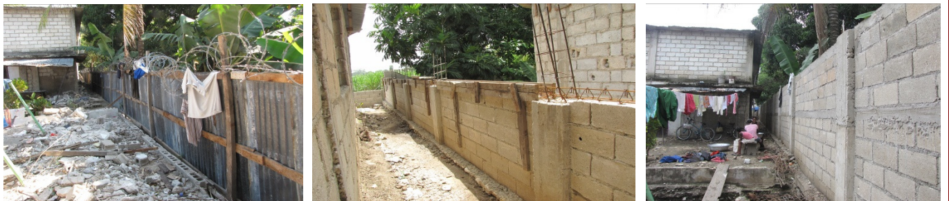
The south wall: not much of a barrier in March - somewhat better in June - now provides a sense of security. The entire wall around the complex has been finished except for stretching some razor wire along the top.