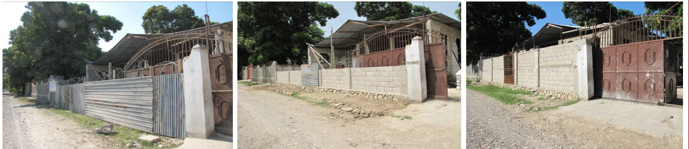
The front wall and gate in March - then as repairs were partially completed in June - and finally as it looked on August 10 th , 2010.