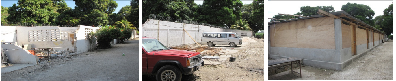
Former classrooms (destroyed January 12 th then removed to keep from injuring anyone in March) now replaced with temporary housing for staff and children, moving them out of tents and helping protect them from hurricanes.