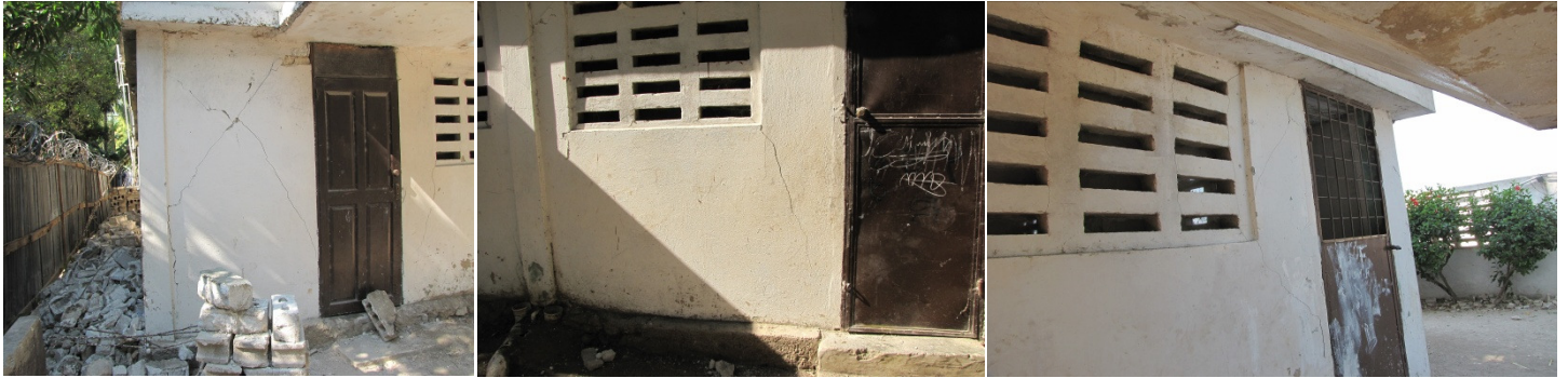
The east end of the main administration building which also houses the boys' home, the guest rooms, and the food storage depots had extensive damage. There was major damage was to the lower wall which is the supporting wall for the second floor. Taken March 2010.

By the time you receive this newsletter, it will be approximately eight months since the earthquake hit Haiti. Many of you have responded so generously to the rebuilding fund. This issue will give you a pictorial report of how you have blessed the children and staff of COPI Haiti and to thank you for your faithfulness. The Lord says in Philippians 4:19: And my God shall supply all your need according to His riches in glory by Christ Jesus. He gave us help when as humans we were overwhelmed by the need. To all of you, you are a blessing. In addition, we were able to take a team of workers for the first time in nearly four years. What joy filled our hearts to interact with the children on your behalf.