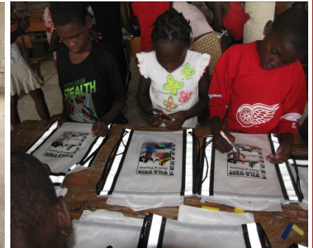
A great job of coloring was evident as in the photo above and others.