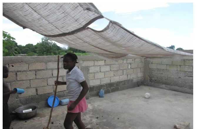
The wall on the balcony of the girls' home left a breach in security. On the right it has been raised and strengthened to give peace of mind to those who need it.