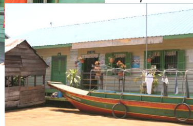
Left—Phat San Die church/home. A floating church home caring for 19 orphans.