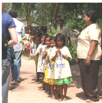
Children at Ou Kon Trom home met the mission team members with leis and bracelets they made from fragrant flowers in the area. These orphans were given to the home by Buddhists who could no longer provide food for them. Today they know and love Jesus as their Savior.