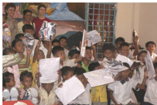
Siem Reap children holding up their packages of new clothes and shoes provided by Children of Promise supporters.