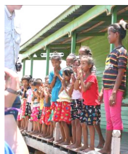
Right—Floating school where Phat San Die children are educated.